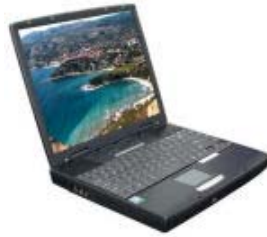
OVERAM Mirage 80