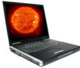
OVERAM Mirage 300