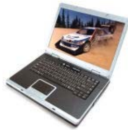
OVERAM Mirage 100